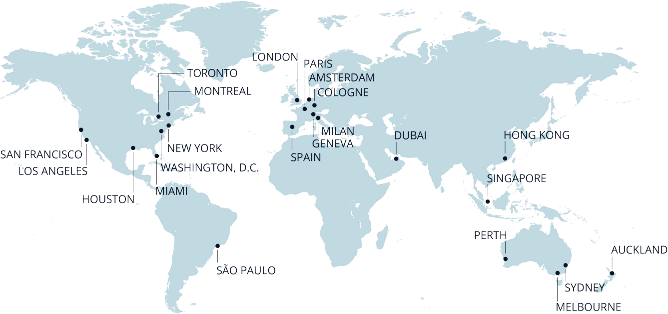
● Current locations and serviced remotely / agents / other

Today's disputes involve multi-national, multi-cultural and multi-lingual parties facing multi-jurisdictional issues and cross-border recoveries. Our global team supports professional advisers around the world to meet these needs for clients.