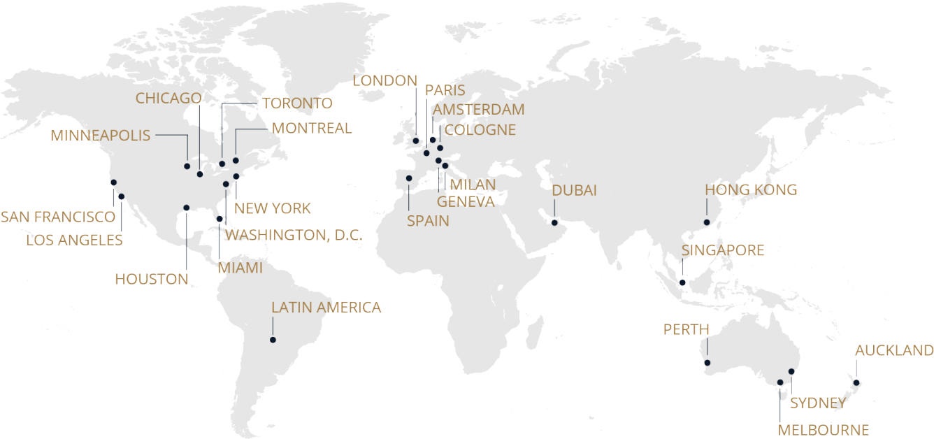
● Current locations and serviced remotely / agents / other

Today's disputes involve multi-national, multi-cultural and multi-lingual parties facing multi-jurisdictional issues and cross-border recoveries. A global team is essential to meet these needs.