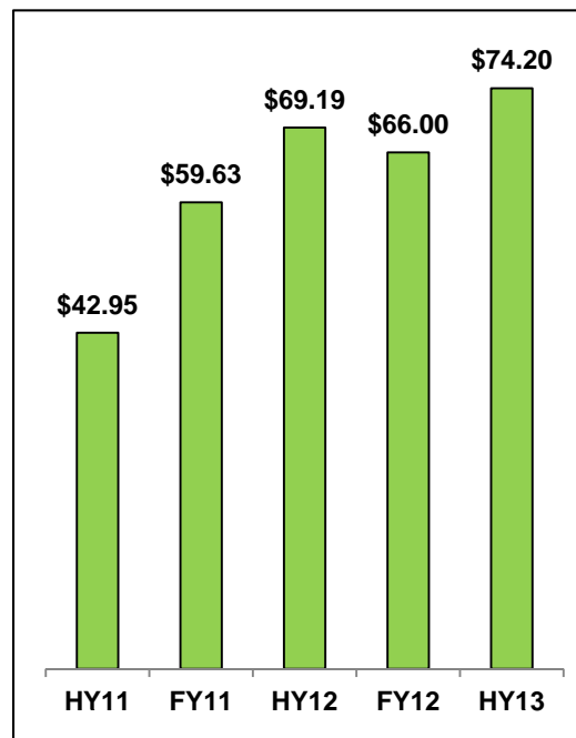
Investments 1 $M